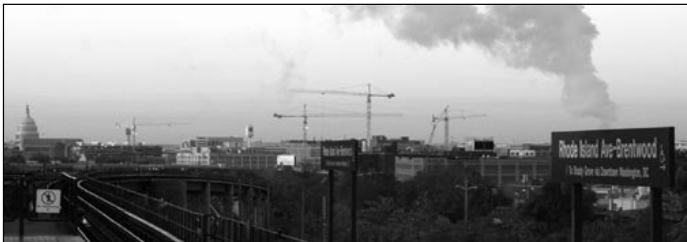
Skyline of D.C. showing many impacts on the environment!

Another item worth noting: Pepco Energy Systems provides energy choice. We can buy 100 percent wind-generated power and support the growth of a truly green alternative energy source. (Visit www.pepcoenergy.com .) It costs a bit more (because subsidies on fossil fuels make coal artificially cheap) but it's important to spur development of clean energy.