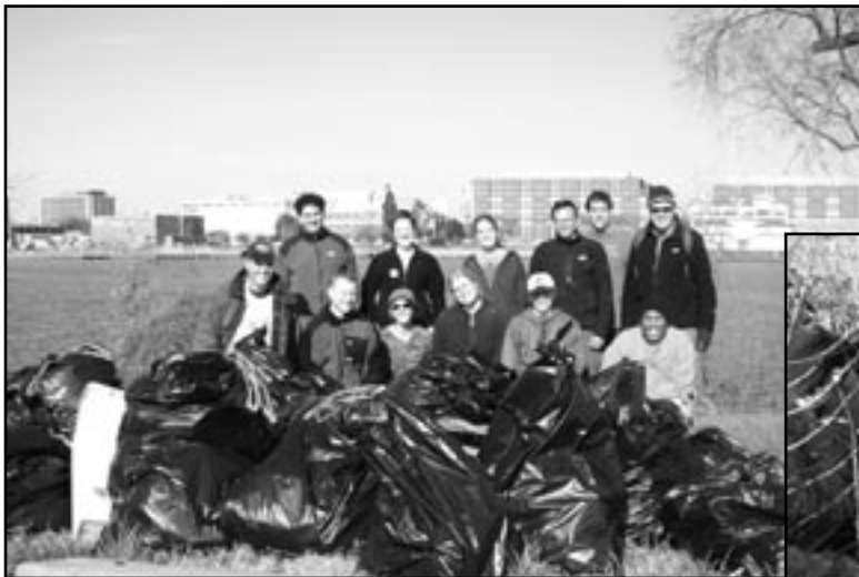
D.C. Sierra Club members collect trash along the shoreline of the Anacostia River at Poplar Point.

The ECC is offering many opportunities in the coming months for volunteers to work with ECC youth on projects ranging from garage pickups to tree plantings to invasive species removal; there will be volunteer days every Saturday in March and every day in April. I am organizing my soccer team to participate in one. I urge you to take advantage of this opportunity to help our city's environment and to get to get more acquainted with our city's other river. For more information about the ECC and its volunteer opportunities, visit the website at www.ecc1.org , call 202-554-1960 or e-mail info@ecc1.org .